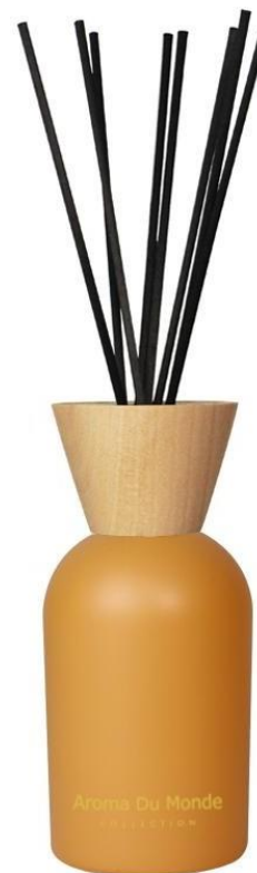
ODMF20-071652 With 200ml oil