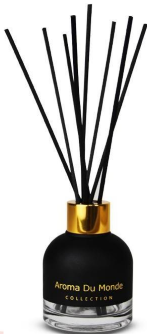
ODMF19-092232 With 100ml oil