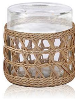
ODMF22-021636 SCENTED CANDLE 200g

ODMF22-021635 Reed diffuser Box size:L9*W9*H25.5cm Weight: 0.45kg Including: 1pc glass bottle(L8*W8*H9cm), 1pc Straw cover 8pc reeds (D0.3*H25cm), 1pc PET bottle , 150ml fragrance solution with 10% fragrance, Package: 350g paper box with with CMYK printing.