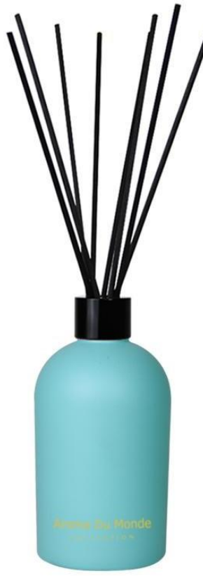
ODMF20-071670 With 200ml oil