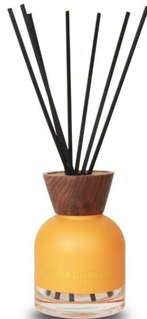
ODMF19-112845 With 100ml oil