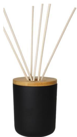
ODMF20- 081451 With 150ml GLASS CUP+WOODEN LID