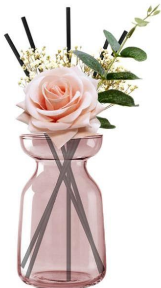
ODMF22-032351 FLOWER REED DIFFUSER