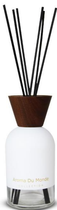
ODMF19-091914 With 200ml oil