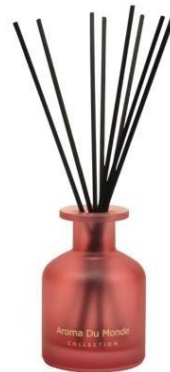
ODMF19-076005 With 45ml oil