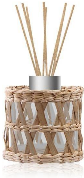
ODMF22-021644 REED DIFFUSER 100ml