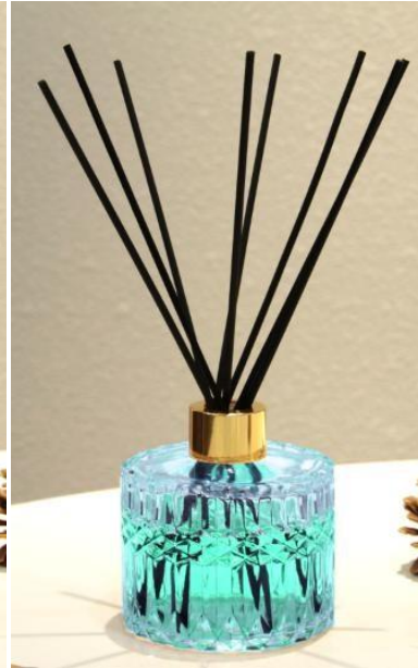
ODMF20-081303 With 200ml oil