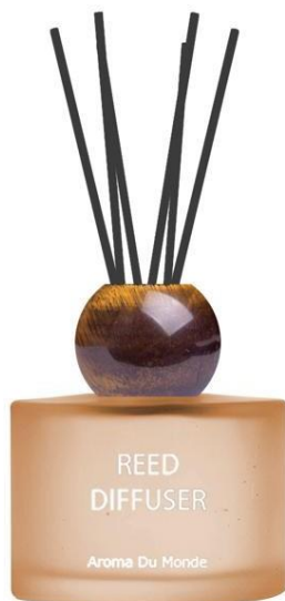
ODMF22-030209 REED DIFFUSER 180ml