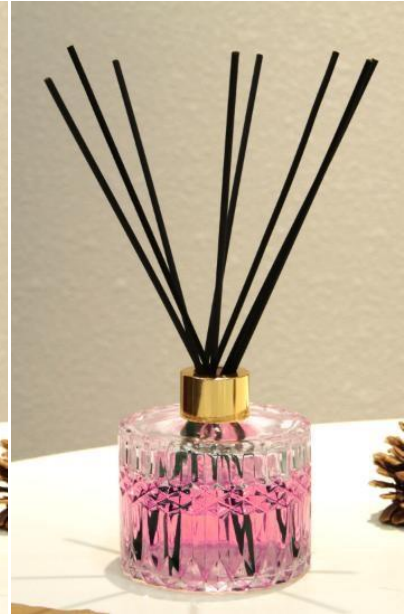
ODMF20-081304 With 200ml oil