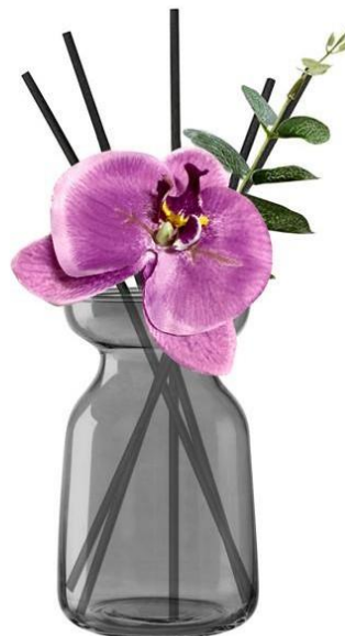
ODMF22-032353 FLOWER REED DIFFUSER