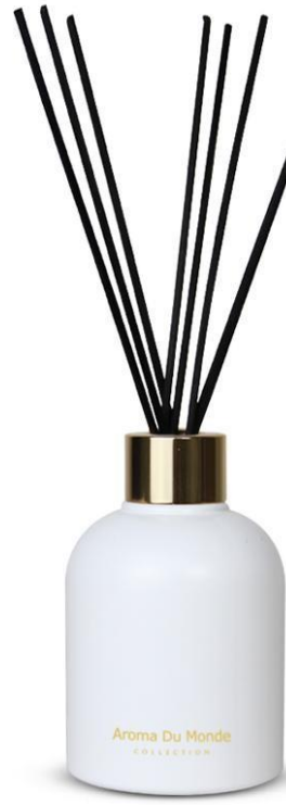
ODMF20-071660 With 150ml oil