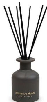
ODMF19-072481 With 100ml oil