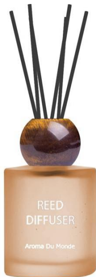
ODMF22-030213 REED DIFFUSER 120ml