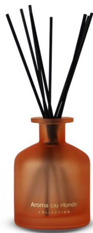
ODMF19-091724 With 190ml oil