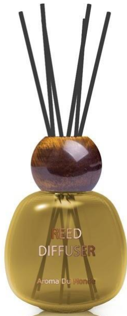
ODMF22-030205 REED DIFFUSER 200ml