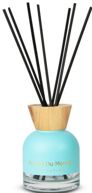
ODMF19-111016 With 100ml oil