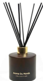
ODMF19-081032 With 100ml oil