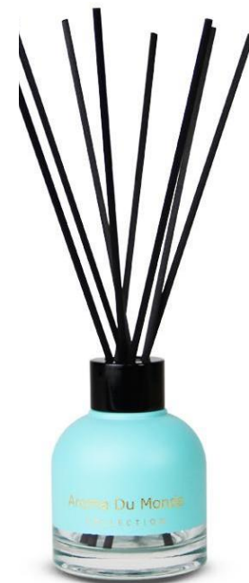
ODMF19-092206 With 100ml oil