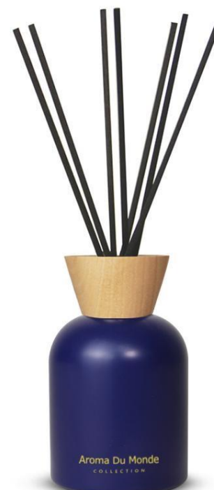
ODMF20-071659 With 100ml oil