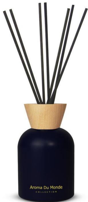
ODMF20-071664 With 100ml oil