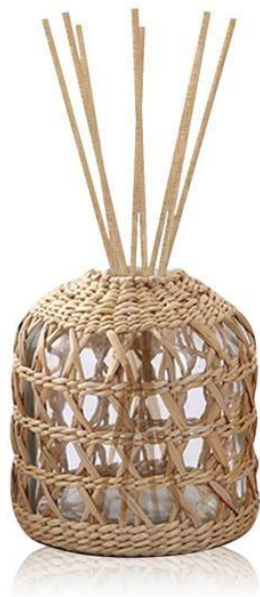
ODMF22-021635 REED DIFFUSER 150ml