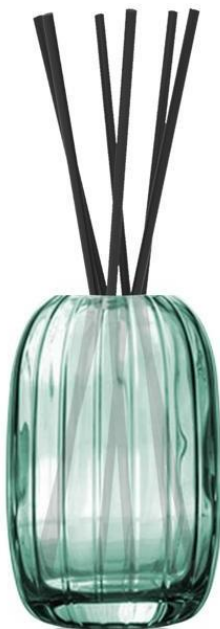
ODMF22-022452 REED DIFFUSER 150ml