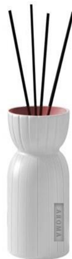
ODMF22-012033-2 REED DIFFUSER 150ML