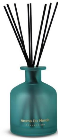
ODMF19-091730 With 190ml oil