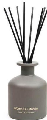
ODMF19-0729010 With 190ml oil