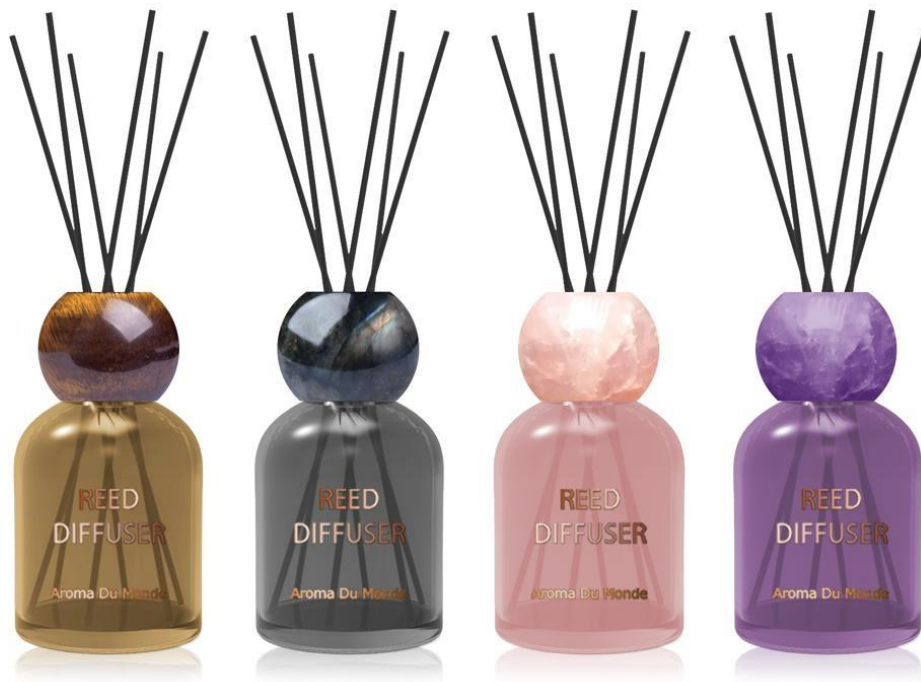
ODMF22-030201 REED DIFFUSER 150ml