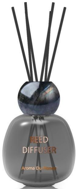
ODMF22-030206 REED DIFFUSER 200ml