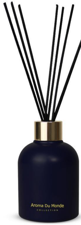
ODMF20-071665 With 150ml oil