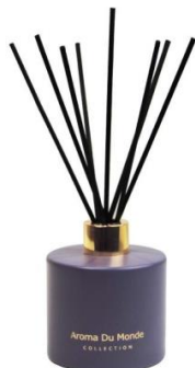
ODMF19-081030 With 100ml oil