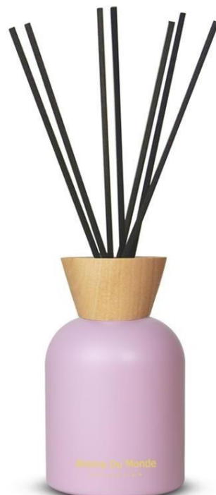
ODMF20-071658 With 100ml oil