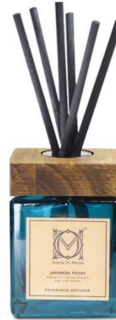
ODMF18-122715 With 180ml oil