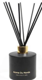
ODMF19-081033 With 100ml oil