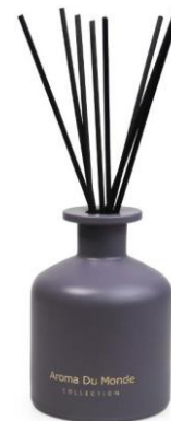
ODMF19-072904 1 With 190ml oil