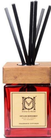
ODMF18-122714 With 180ml oil