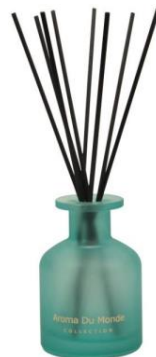
ODMF19-070973 With 100ml oil