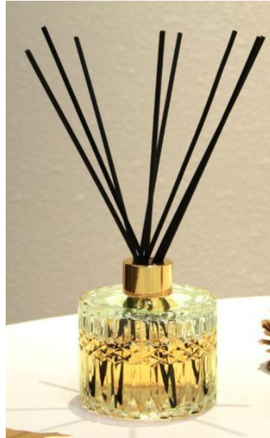
ODMF20-081302 With 200ml oil