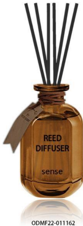
ODMF22-011162 REED DIFFUSER 150ML