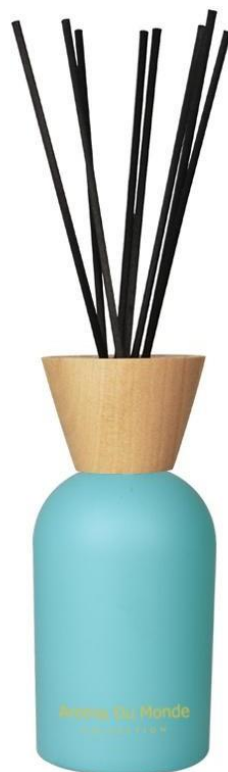
ODMF20-071650 With 200ml oil