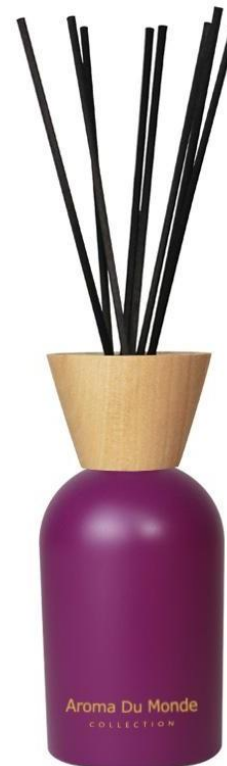
ODMF20-071651 With 200ml oil