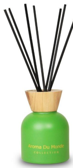
ODMF19-112850 With 100ml oil