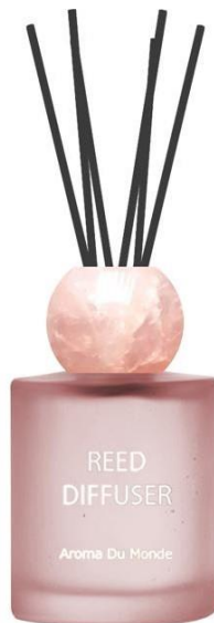
ODMF22-030215 REED DIFFUSER 120ml