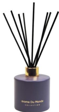
ODMF19-072473 With 200ml oil