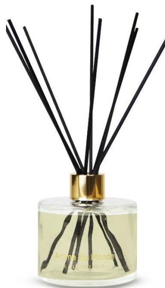
ODMF20-081056 With 100ml oil