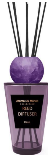
ODMF21-112513 REED DIFFUSER 200ML