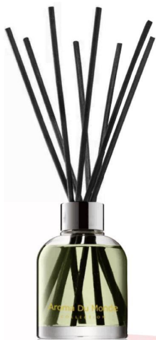
ODMF20-071671 With 100ml oil