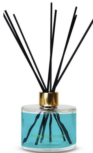
ODMF20-081055 With 100ml oil