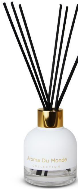
ODMF19-091915 With 100ml oil