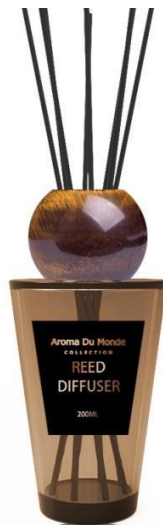
ODMF21-112510 REED DIFFUSER 200ML