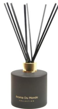
ODMF19-072475 With 200ml oil