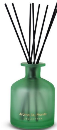
ODMF19-091727 With 190ml oil