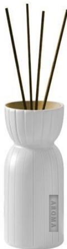
ODMF22-012033 REED DIFFUSER 150ML