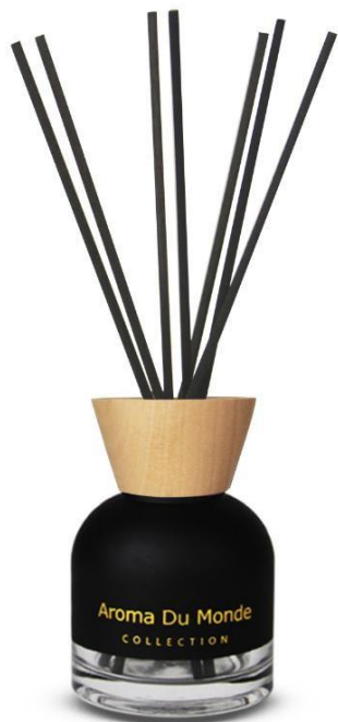
ODMF19-111015 With 100ml oil