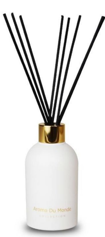
ODMF20-071666 With 200ml oil