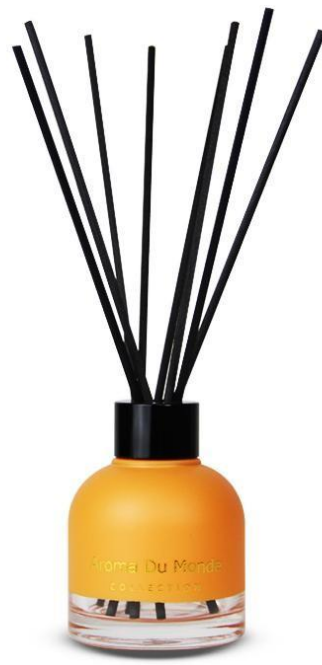
ODMF19-092203 With 100ml oil