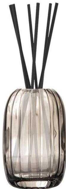
ODMF22-022451 REED DIFFUSER 150ml