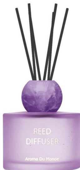
ODMF22-030212 REED DIFFUSER 180ml