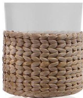
ODMF22-021642 SCENTED CANDLE 200g

ODMF22-021641 Reed diffuser Box size:L9*W9*H25.5cm Weight: 0.45kg Including: 1pc glass bottle(L7*W7*H7.5cm), 1pc silver lid; 1pc Straw cover 8pc reeds (D0.3*H25cm), 150ml fragrance solution with 10% fragrance, Package: 350g paper box with with CMYK printing.