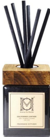
ODMF18-122712 With 180ml oil