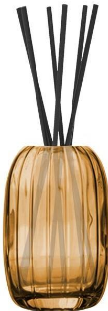
ODMF22-022453 REED DIFFUSER 150ml