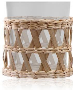
ODMF22-021645 SCENTED CANDLE 200g

ODMF22-021644 Reed diffuser Box size:L9*W9*H25.5cm Weight: 0.45kg Including: 1pc glass bottle(L7*W7*H7.5cm), 1pc silver lid; 1pc Straw cover 8pc reeds (D0.3*H25cm), 150ml fragrance solution with 10% fragrance, Package: 350g paper box with with CMYK printing.