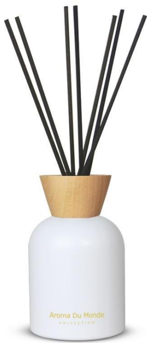
ODMF20-071657 With 100ml oil