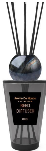
ODMF21-112511 REED DIFFUSER 200ML