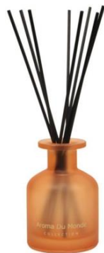
ODMF19-070972 With 100ml oil