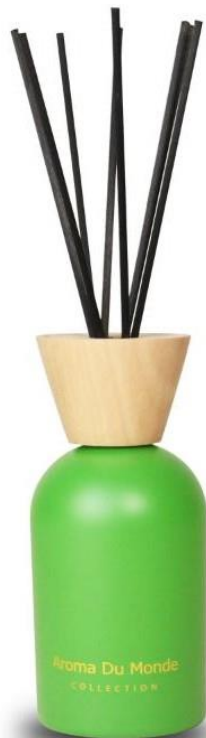
ODMF19-112846 With 200ml oil