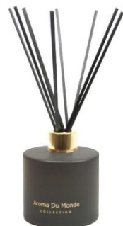
ODMF19-081031 With 100ml oil