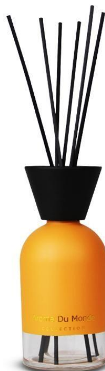
ODMF19-092202 With 200ml oil