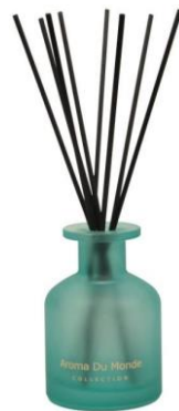
ODMF19-070973-1 With 45ml oil