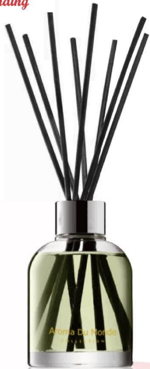
ODMF20-0716712 With 150ml oil