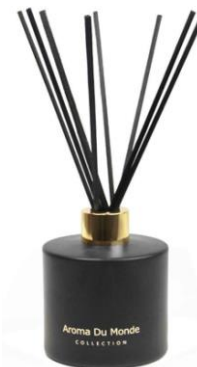
ODMF18-040415 With 200ml oil