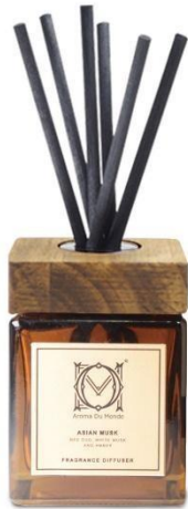
ODMF18-122713 With 180ml oil