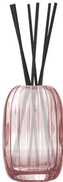
ODMF22-022454 REED DIFFUSER 150ml