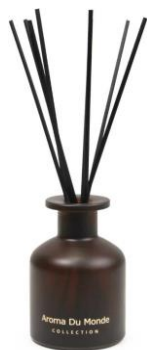
ODMF19-072479 With 100ml oil