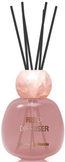
ODMF22-030207 REED DIFFUSER 200ml