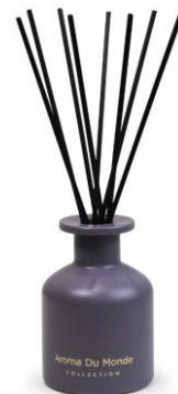
ODMF19-072483 With 100ml oil