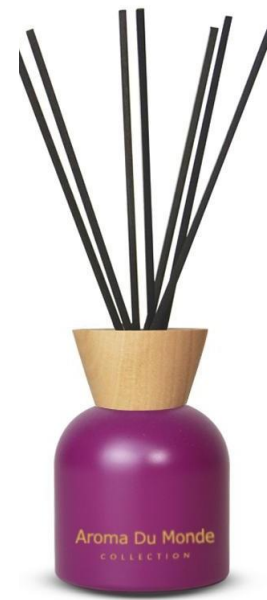
ODMF20-071654 With 100ml oil