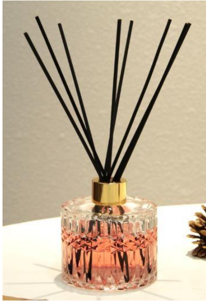
ODMF20-081301 With 200ml oil