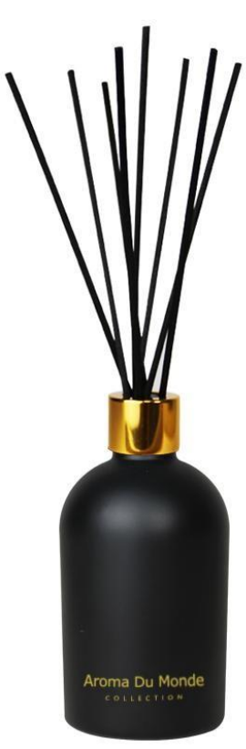
ODMF20-071668 With 200ml oil