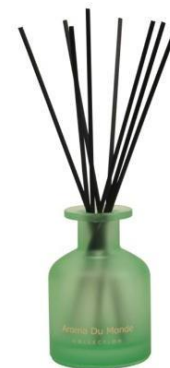
ODMF19-076003 With 100ml oil