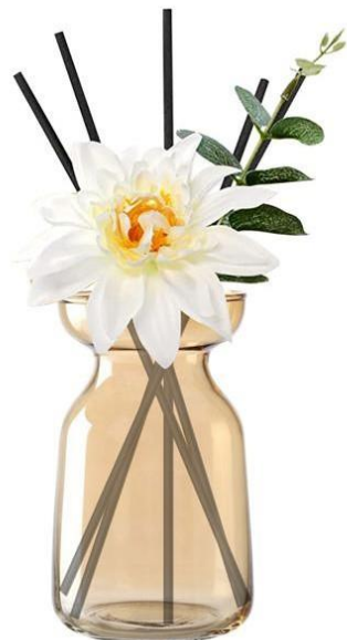
ODMF22-032352 FLOWER REED DIFFUSER