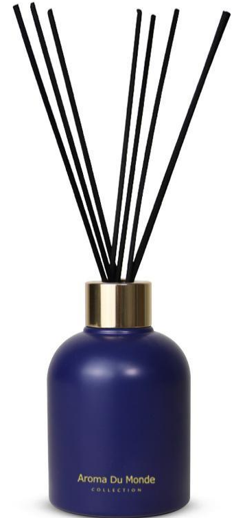
ODMF20-071662 With 150ml oil