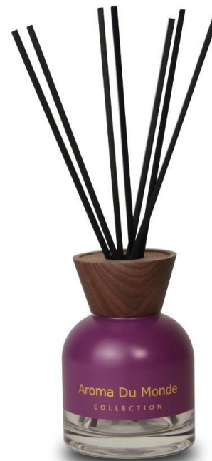
ODMF19-111006 With 100ml oil