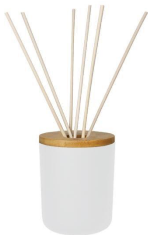
ODMF20- 081456 With 150ml GLASS CUP+WOODEN LID