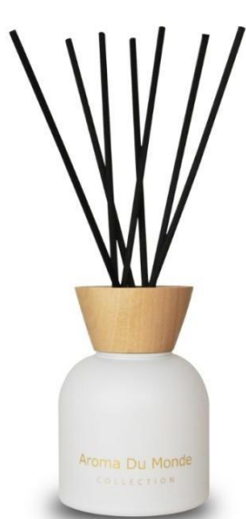
ODMF19-112849 With 100ml oil