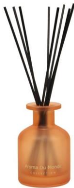
ODMF19-070972-1 With 45ml oil