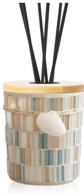
ODMF22-020944 REED DIFFUSER 150ml