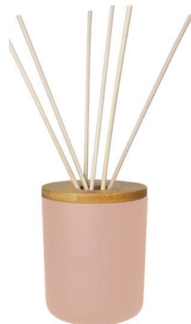
ODMF20- 081453 With 150ml GLASS CUP+WOODEN LID