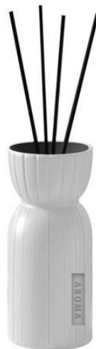
ODMF22-012033-1 REED DIFFUSER 150ML