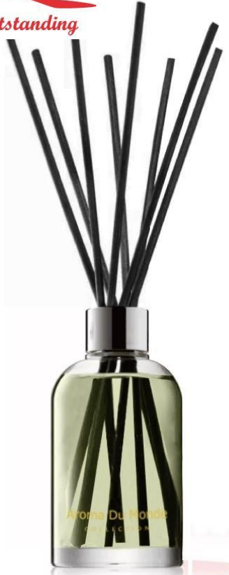
ODMF20-0716713 With 200ml oil