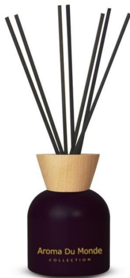
ODMF20-071655 With 100ml oil