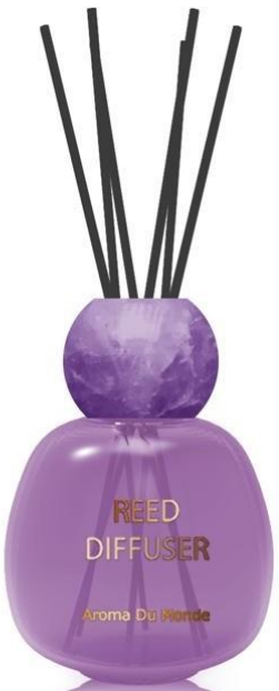
ODMF22-030208 REED DIFFUSER 200ml