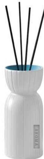
ODMF22-012033-3 REED DIFFUSER 150ML