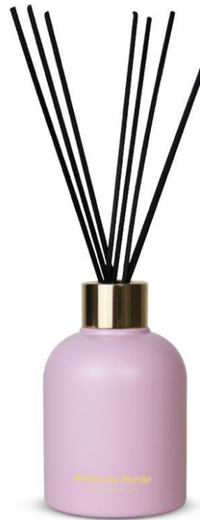
ODMF20-071661 With 150ml oil