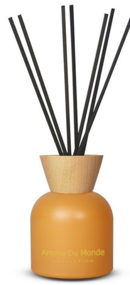
ODMF20-071656 With 100ml oil