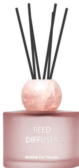
ODMF22-030211 REED DIFFUSER 180ml