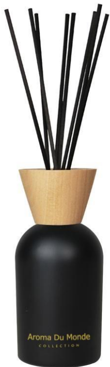
ODMF20-071653 With 200ml oil