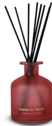
ODMF19-091721 With 190ml oil