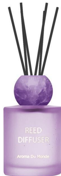
ODMF22-030216 REED DIFFUSER 120ml