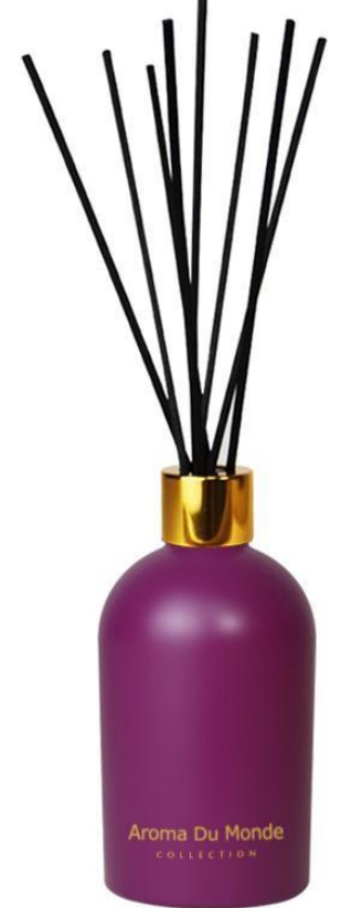
ODMF20-071669 With 200ml oil