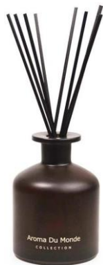
ODMF19-0729012 With 190ml oil