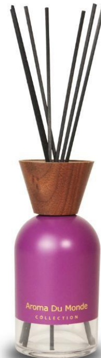
ODMF19-112853 With 200ml oil