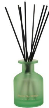
ODMF19-076007 With 45ml oil