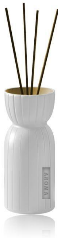
ODMF22-012033 REED DIFFUSER 150ML