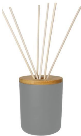
ODMF20- 081452 With 150ml GLASS CUP+WOODEN LID