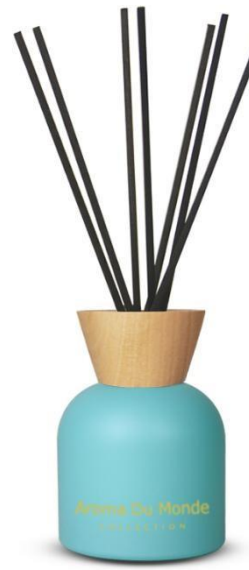
ODMF20-071663 With 100ml oil