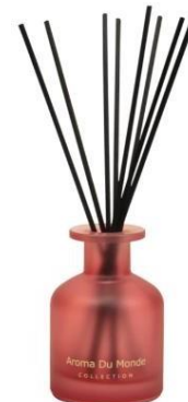
ODMF19-076001 With 100ml oil