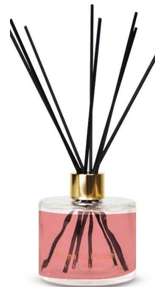
ODMF20-081057 With 100ml oil