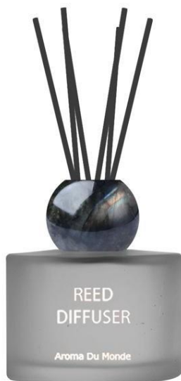
ODMF22-030210 REED DIFFUSER 180ml