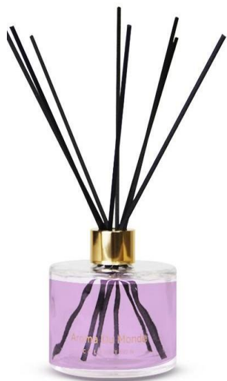
ODMF20-081054 With 100ml oil