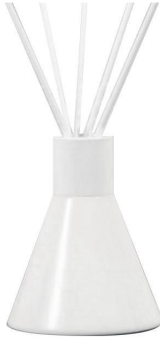
ODMF22-011432 REED DIFFUSER 100ML