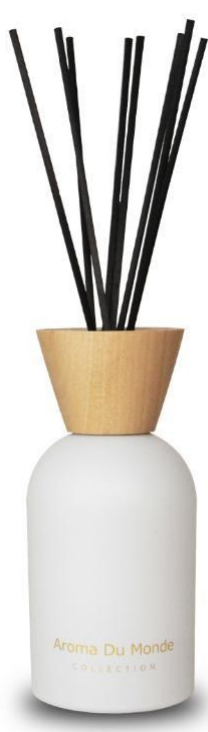
ODMF19-112848 With 200ml oil