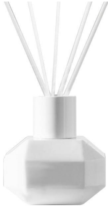
ODMF22-011431 REED DIFFUSER 100ML