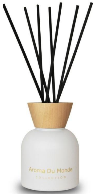
ODMF19-112849 With 100ml oil