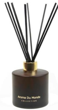
ODMF19-072477 With 200ml oil