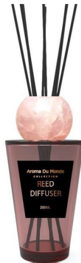
ODMF21-112512 REED DIFFUSER 200ML