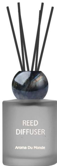
ODMF22-030214 REED DIFFUSER 120ml