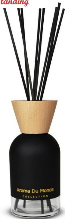
ODMF19-111009 With 200ml oil