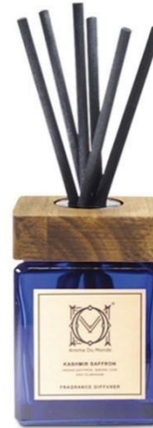
ODMF18-122711 With 180ml oil