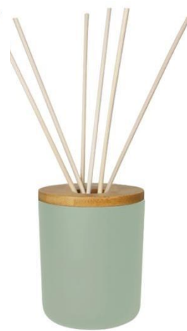
ODMF20- 081454 With 150ml GLASS CUP+WOODEN LID