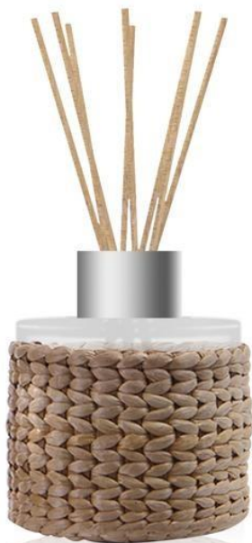
ODMF22-021641 REED DIFFUSER 100ml