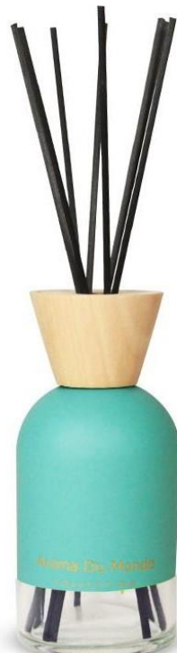
ODMF19-111008 With 200ml oil